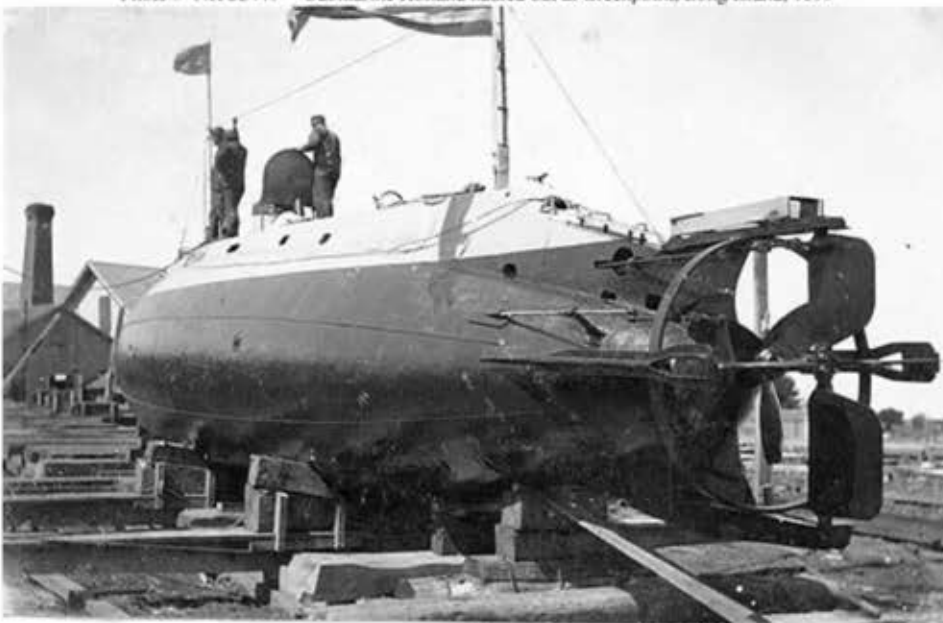
Photo # NH 53449 Submarine Holland hauled out at Greenpoint, Long Island, 1899

We are thinking of entering the Grand Day Parade in St Paul, which has been postponed for a few years now. We appreciate any thoughts before we commit to plans to bring any of the Base floats.