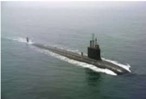
USS Minnesota SSN-783